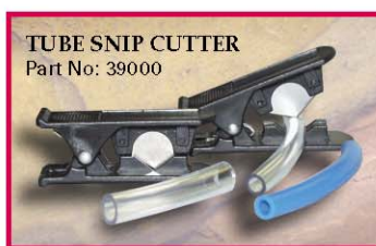
TUBE SNIP CUTTER Part No: 39000

Special order and custom runs available. Product samples are available upon request.