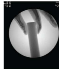
TECAPEEK™ Classix™ XRO™ Radio Opaque materials are clearly visible on X-rays.

These materials are offered for extended time contact with the patient and are tested by resin lot with an additional cytotoxicity test by extrusion lot. A typical extended contact application would be temporary dental implants. Since plastics are typically transparent to X-rays, the XRO formulation allows oral surgeons to see the orientation of the temporary abutment by reflecting the X-rays, thus making the part visible.