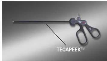
Application showing the use of TECAPEEK™ in an endoscopic surgical device.

TECAPEEK™ grades are characterized by high strength, extreme resistance to hydrolysis and resistance to ionizing radiation. All conventional sterilization methods are compatible. The above medical grades are supported with biocompatibility testing to the ISO10993 matrix to support their use in contact with blood and tissue for 24 hours or less. Additionally, Ensinger is an authorized converter for Invibio's PEEK™ Classix™ resin. PEEK™ Classix™ is tested by resin lot to support contact with the patient for up to 30 days.